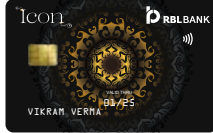
Icon Annual Fees Rs 5000