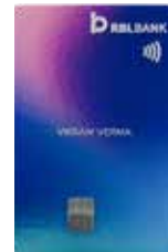
Shoprite Annual Fees Rs 500