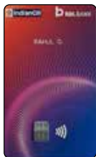
IndianOil RBL Bank Credit Card Monthly Fees Rs 500