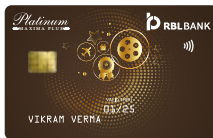
Platinum Maxima Plus Annual Fees Rs 2500