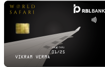
World Safari Annual Fees Rs 3000