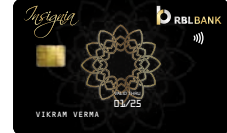
Insignia Annual Fees Rs 7000