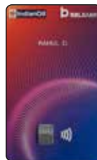
IndianOil RBL Bank XTRA Credit Card Monthly Fees Rs 1500