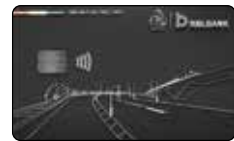
IRCTC RBL Bank Credit Card Monthly Fees Rs 500