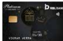
Platinum Delight Annual Fees Rs 1000