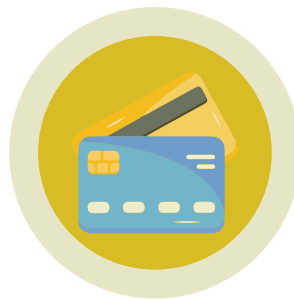
Manage your Card