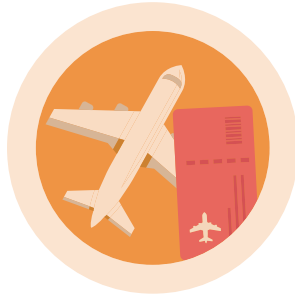
Travel & Mobility